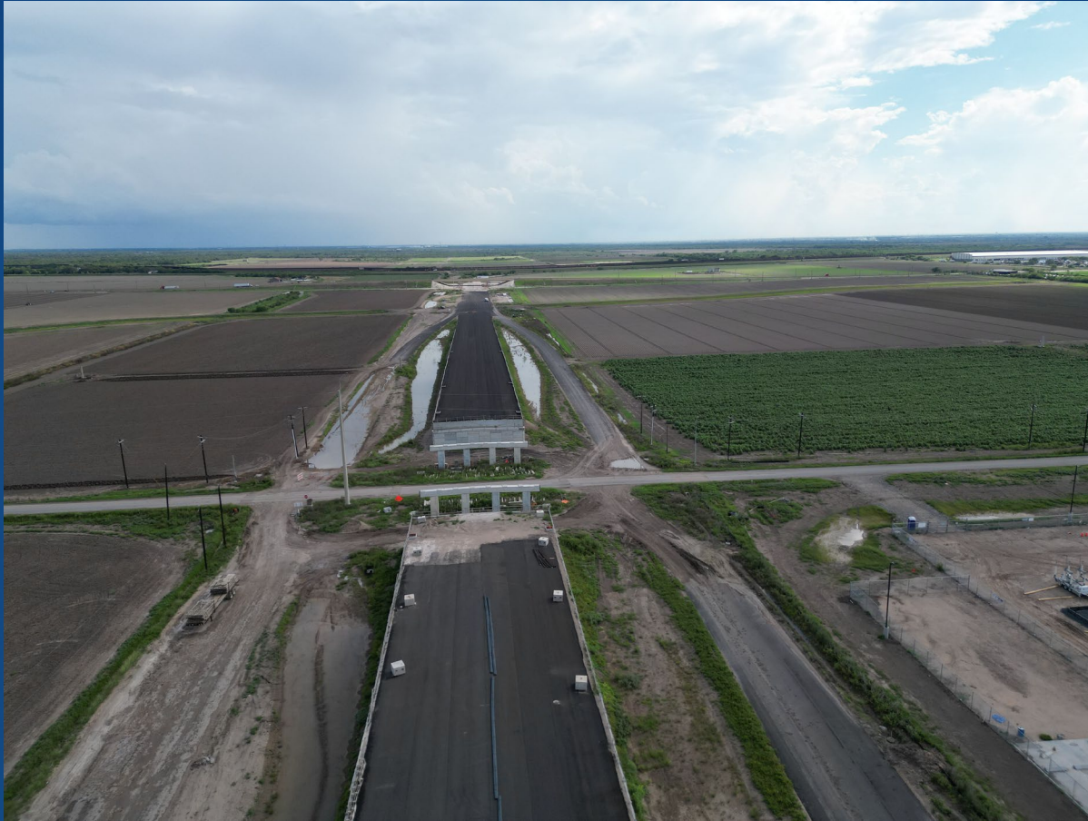
Hi-Line Rd. Intersection (Looking South)