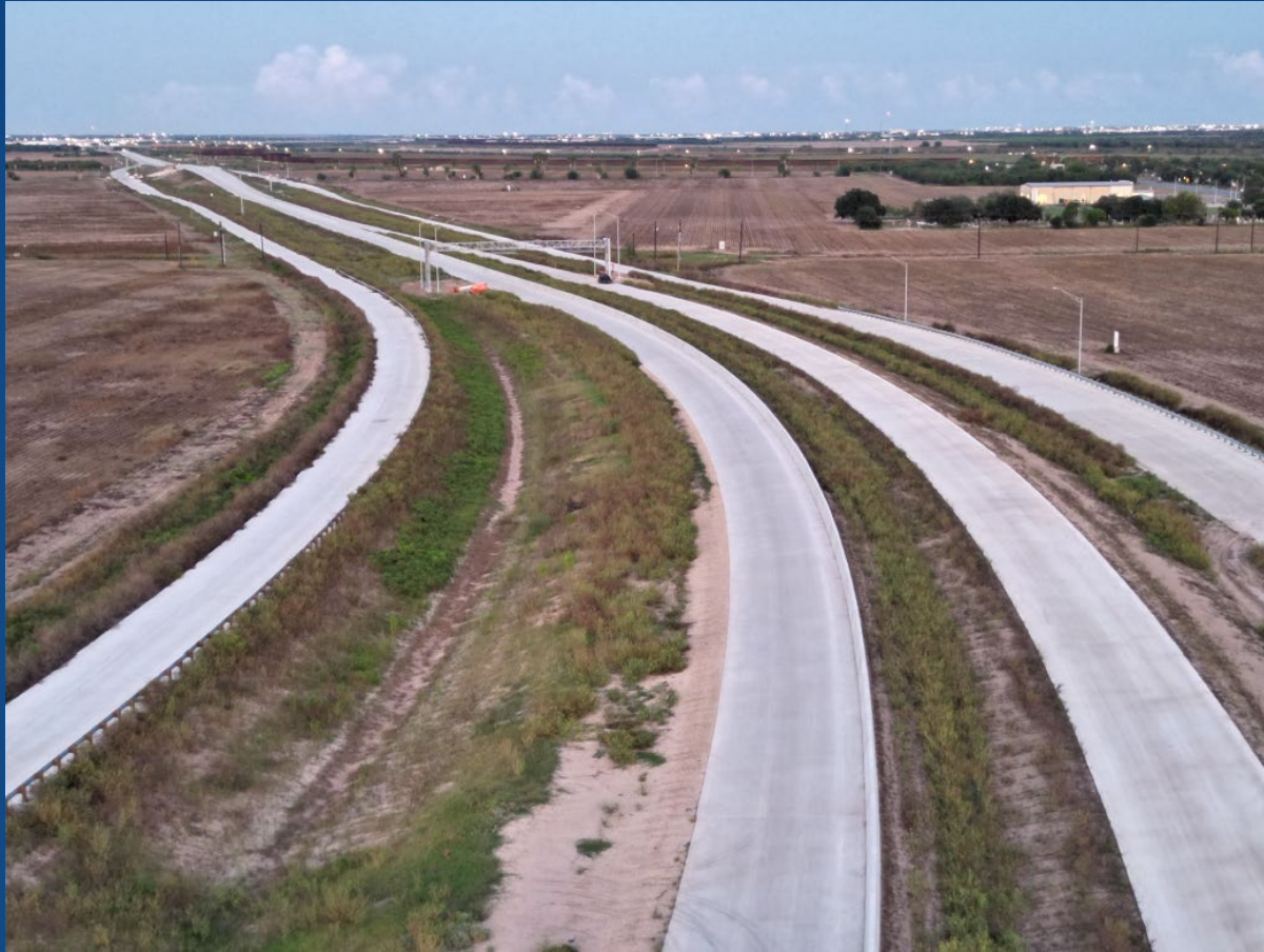
Anzalduas Bridge. Intersection (Looking East)