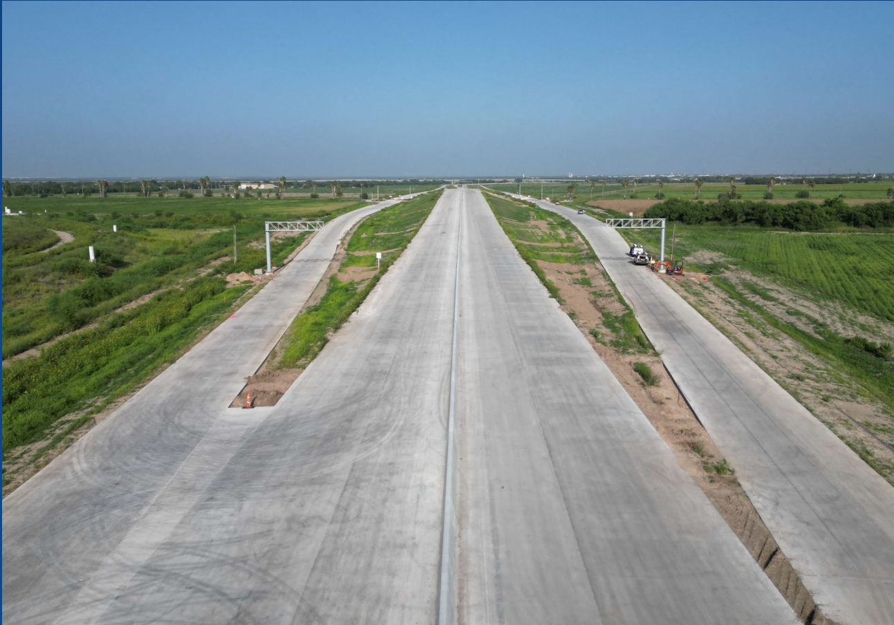
Shary Rd. Intersection (Looking West)