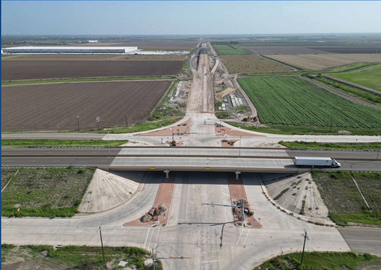
Military Hwy. Intersection (Looking North)