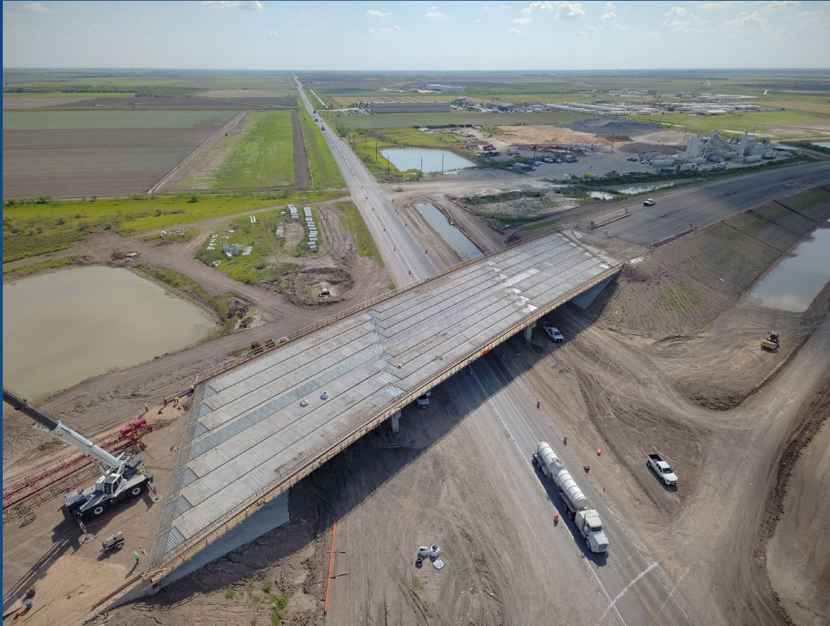
Dicker Rd. Intersection (Looking East)