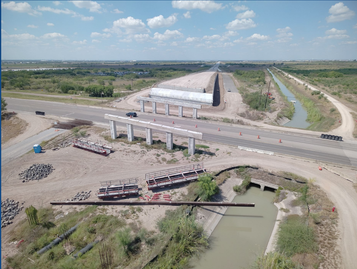
Jackson Rd. Intersection (Looking South)