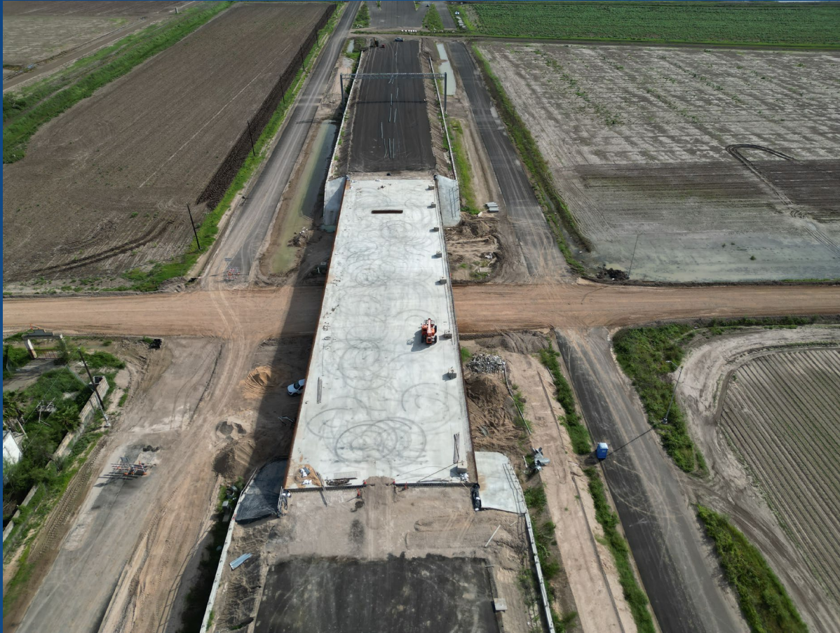
Anaya Rd. Intersection (Looking South)